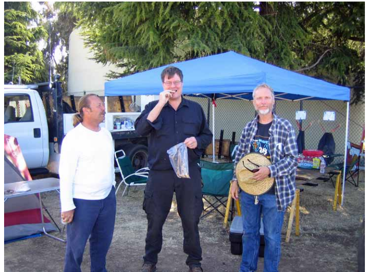
Chocolate chip cookies keep the team going.