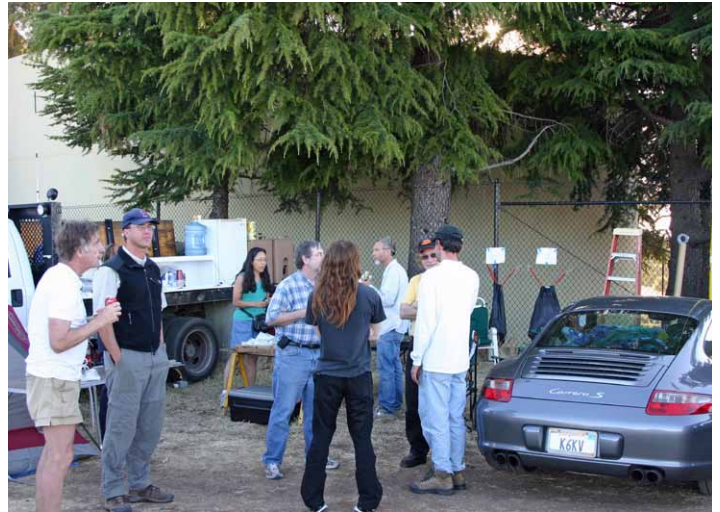
Taking a break for dinner.