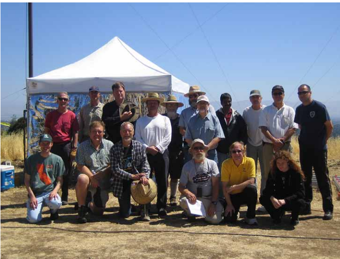
The tired but happy WVARA team at the end of Field Day.