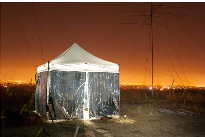
CW tent during graveyard shift. Lights from Silicon Valley are visible down the hill.