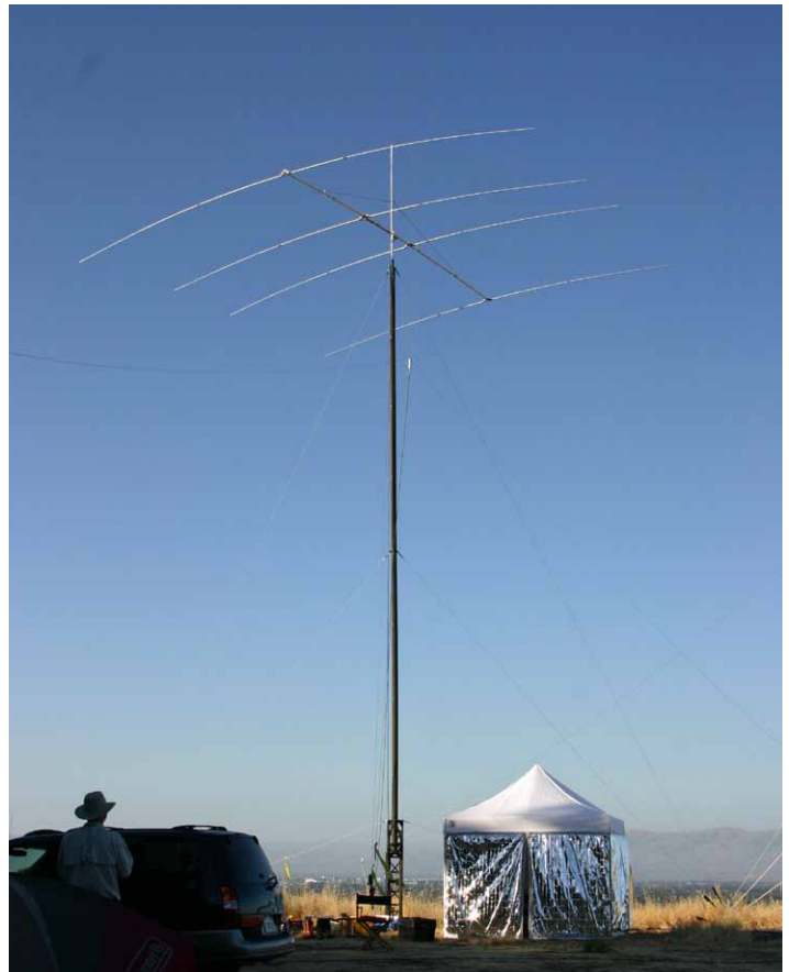
Our three CW stations operated from inside a mylar-coated tent. The mylar reflected away the sun's heat and kept out the sun's glare. Our four element 20 meter monobander was mounted on top of a 50 foot AB-577 portable mast.