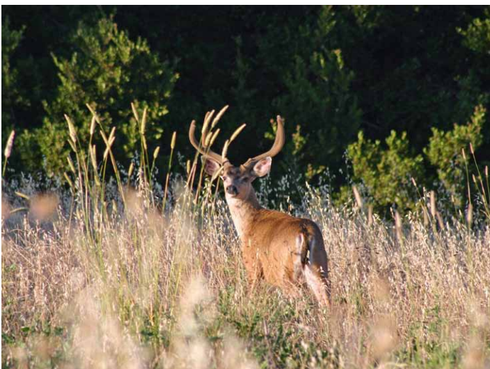
Our first visitor!