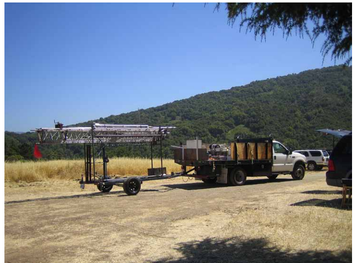
Heading home with the tower trailer.