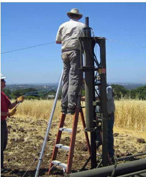
Nick KZ2V setting up AB-577 portable mast.