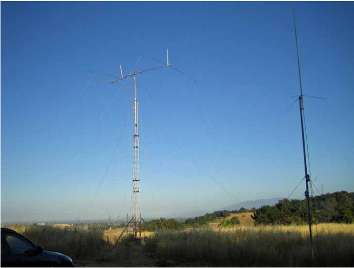
It may be hard to see the white wires suspended from the yagi boom, but this was our full-sized 2 element 40 meter quad.