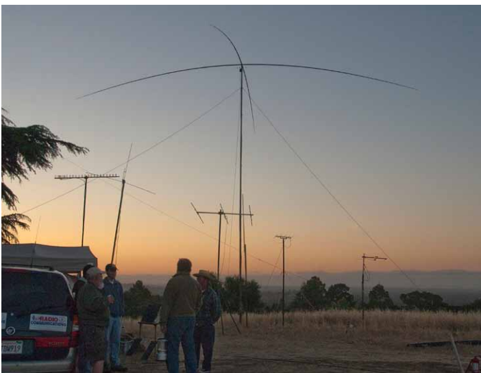
Sunset with the 40 meter switchable crossed-dipole array in the background.