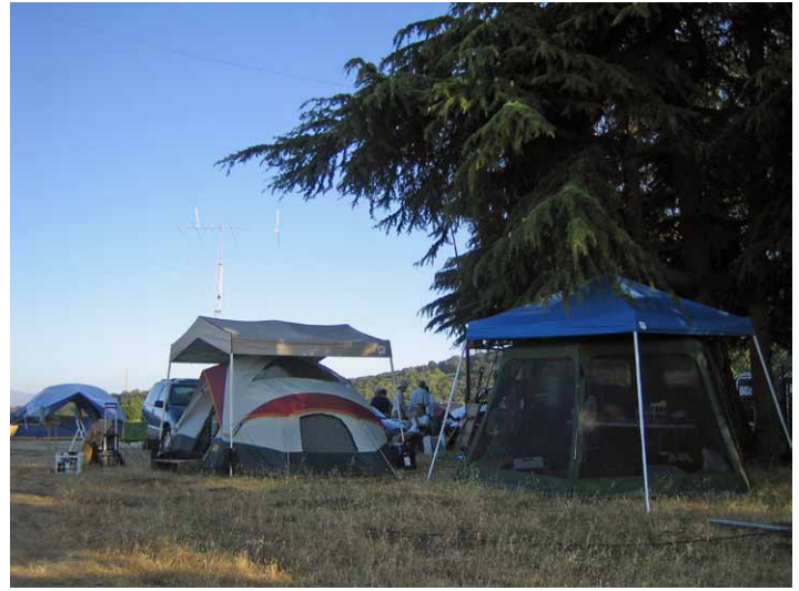
The VHF/UHF and Digital stations.