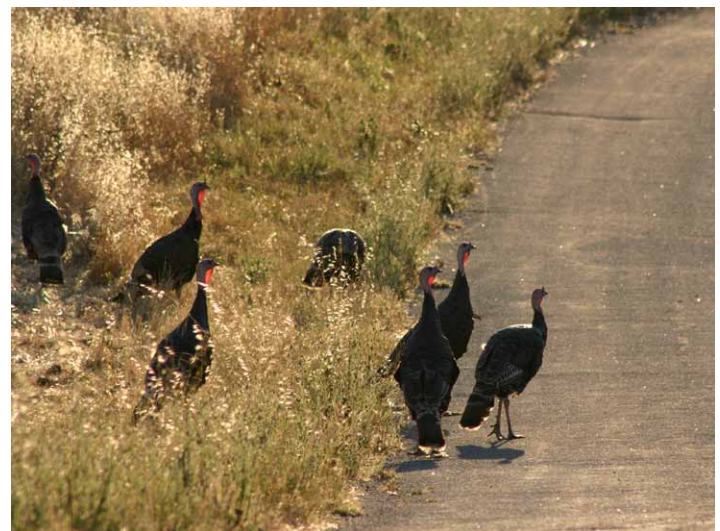
More visitors on the way, heading to the GOTA station.