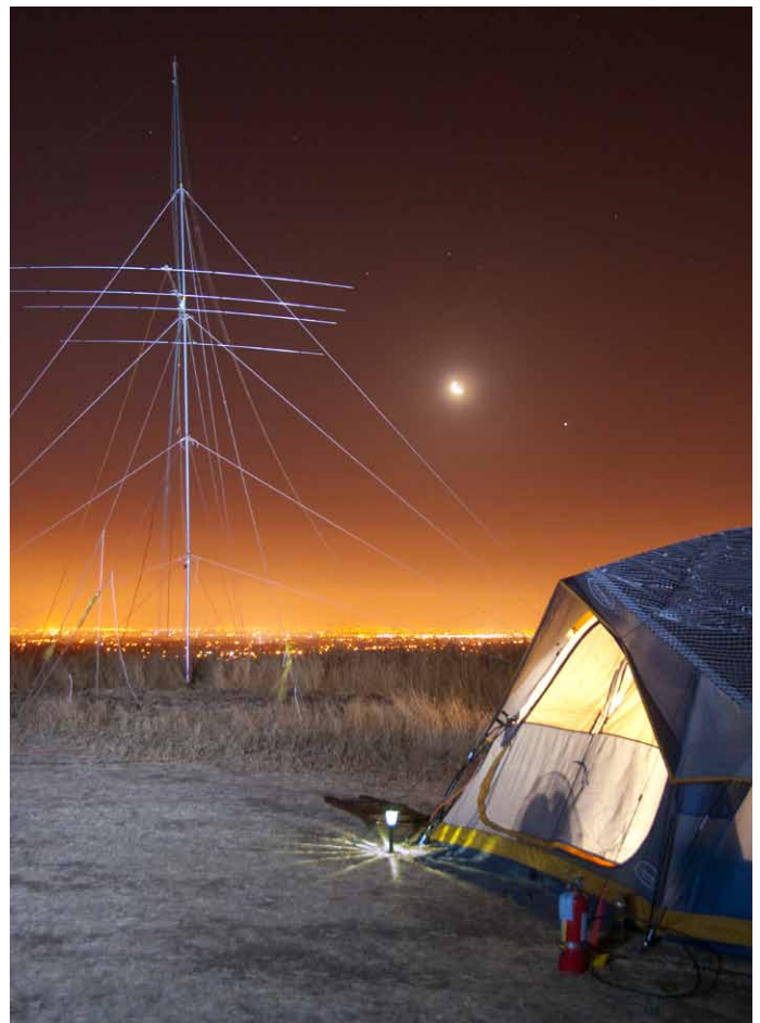
Moonrise over the 20m SSB tent.