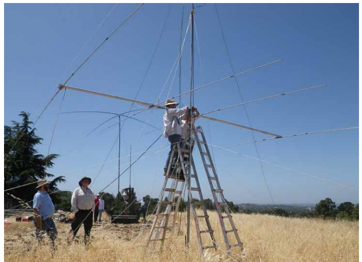
We start by putting up antennas: installing the 15 meter yagi.