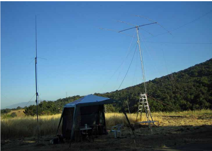
Our GOTA station and antenna.