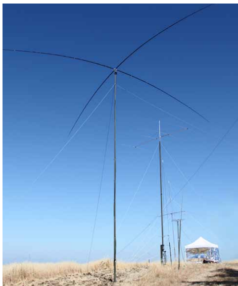
Full-sized, switchable, crossed dipoles for 40m (foreground) plus 4 element monobanders for 20 & 15 made running QRP an entirely new experience!