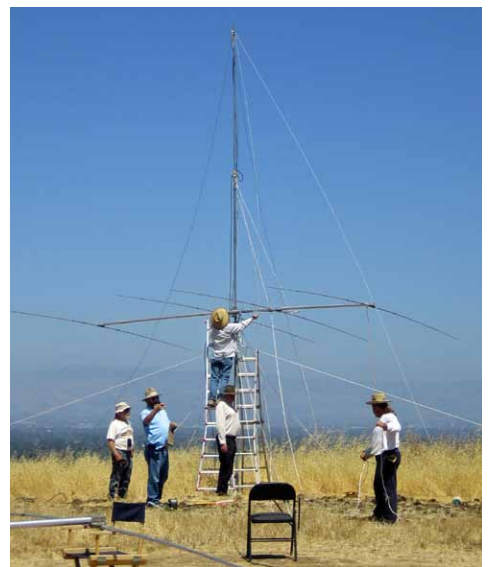
80 meter wire antenna.