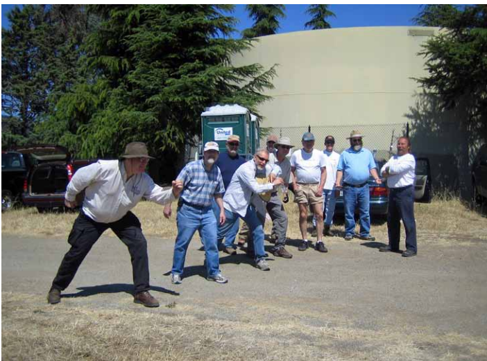
Waiting to begin setting up on Friday.