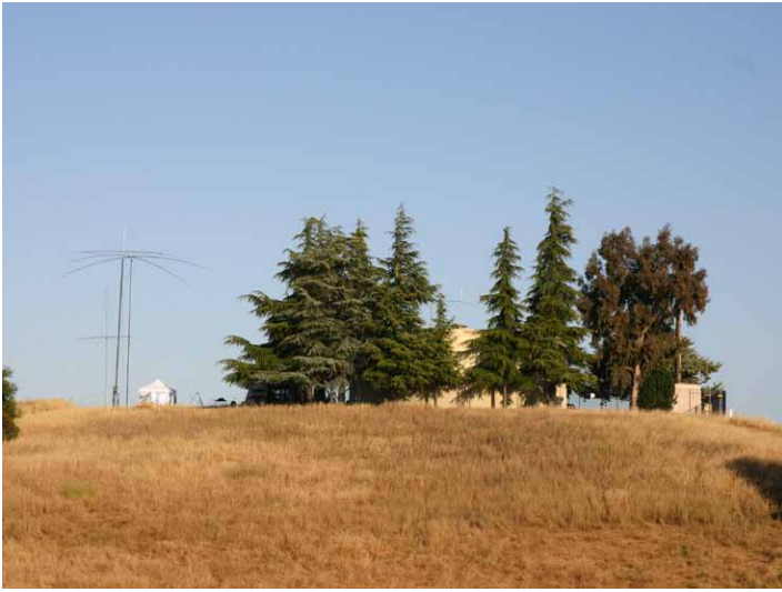
Our FD site from a distance.