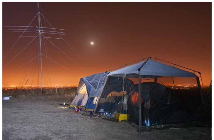
Moonrise over the SSB tents.