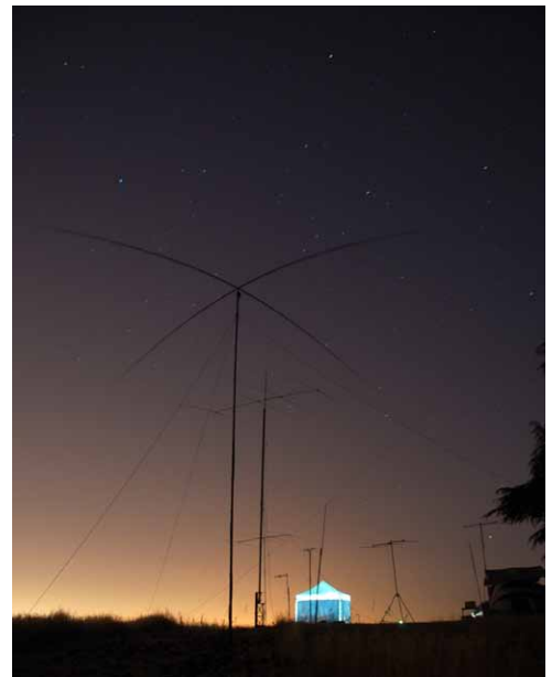
WVARA Field Day at Mora Hill during graveyard shift.