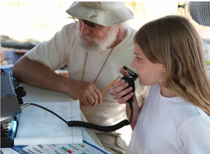
A young operator on the air.