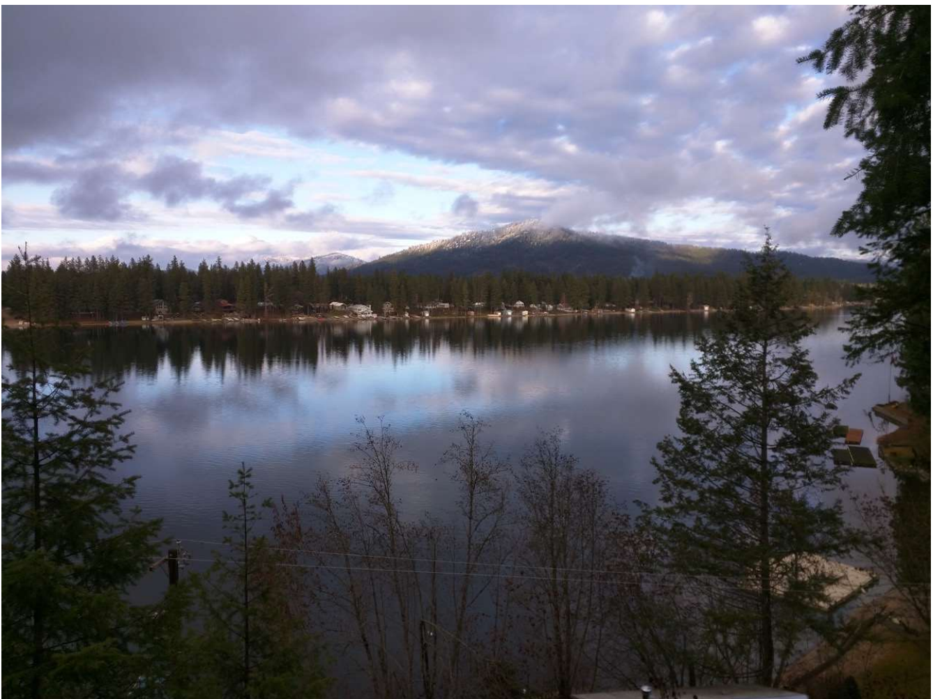
The view from my cabin at Loon Lake, WA (before the snowstorm).

Next year I definitely intend to replace the dipole with an inverted L and maybe a separate receive antenna further back in the woods where it will be farther from the power line.